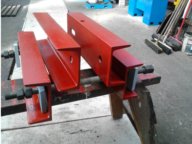
Spotted recently were these "timber clamps" being manufactured in accordance with approved engineering drawings to be fitted as part of the bridge maintenance over the Winter period.