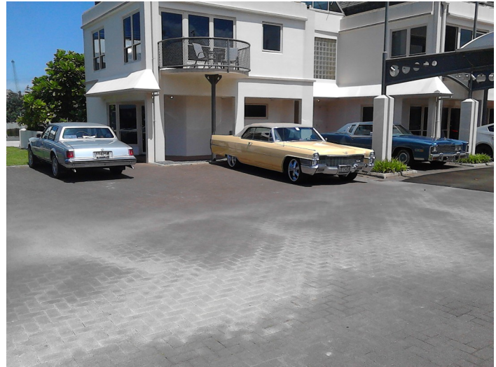
Some of the Cadillacs spotted in and around the Pacific Harbour Motor Inn.